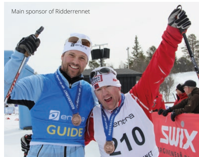
Main sponsor of Ridderrennet

Since 2014, Entra has been engaged as a sponsor of the Church City Mission in Norway. The Church City Mission's vision is that people in the city should experience respect, justice and care and through such co-operation Entra contributes to positive urban development. Entra's financial support to, and dialogue with, the Church City Mission strengthens the constructive measures that the Church City Mission is carrying out in connection with social challenges in the cities covered by the agreement: Oslo and the surrounding districts, Bergen and Trondheim. In Oslo, Entra is involved, among other things, in the newly started "Neighbour cooperation", which involves