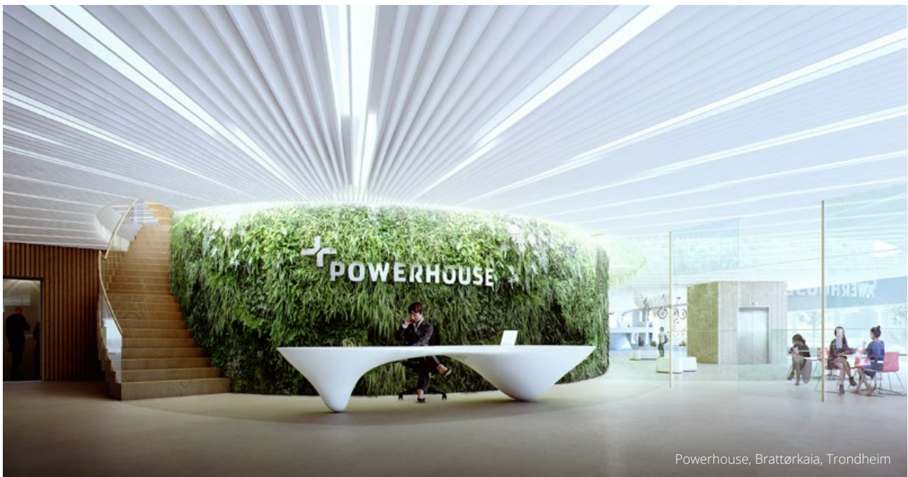
Powerhouse, Brattørkaia, Trondheim

BREEAM Excellent or better on new buildings and BREEAM-NOR Very Good for refurbishments (and energy class A). In addition Entra is considering using BREEAM-NOR In-Use as a standard for classification on existing buildings in the portfolio. The objective with BREEAM-NOR In-Use is strengthened sustainability in existing buildings. Entra has participated with a pilot building in a trial of this method, and has plans for a new pilot building on the next release of the method parameters.